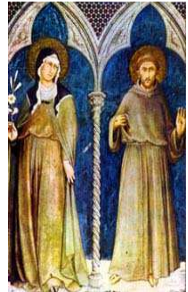
Saints Clare and Francis of Assisi

Anyone who is interested is invited to attend the meeting of a fraternity. You will have a period of formation that is divided into three stages to allow you to discern your call prior to formal profession as a Secular Franciscan. First, orientation lasts about 3 months; next, inquiry takes about six months and last, the candidacy period can take 2 or more years, depending on how you progress in your formations.